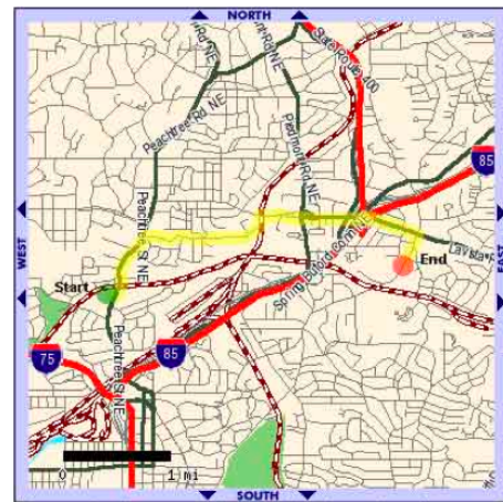
Fig. 3. An example GPS map showing location designations and a trip

provide qualitative results where they are needed. Finally, with the proliferation of activity monitors being marketed to the general public as a personal tool to assist with health and exercise, it would seem to follow that a device such as the WhAMI could be used by wheelchair users as a personal tool for monitoring their own health and activity.